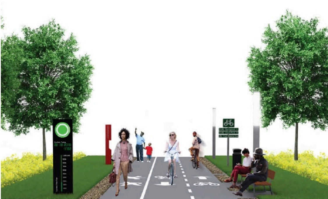
A typical trail design

News from the Trail – April 2021 < https://detroitgreenways.org/news-from-the-trail-april-2021/>