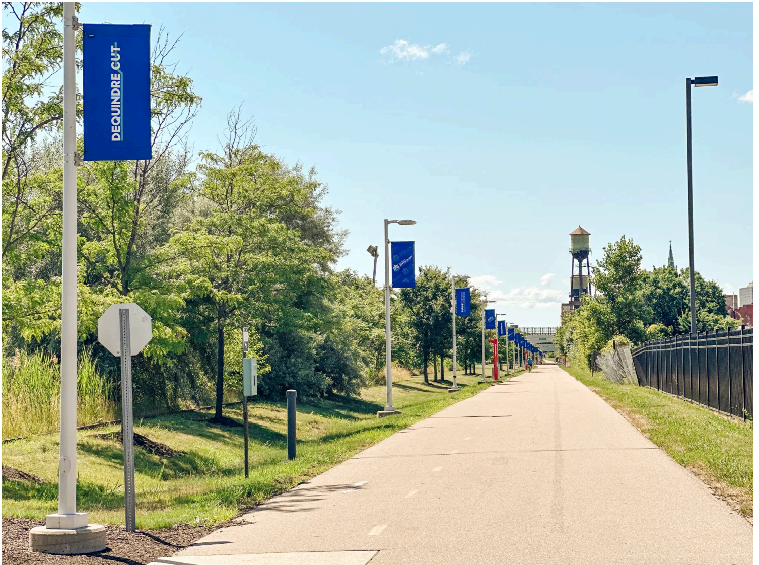
The Dequindre Cut will soon be connected to the Joe Louis Greenway.

by Juniper Favenyesi July 2, 2024 4:34 pm